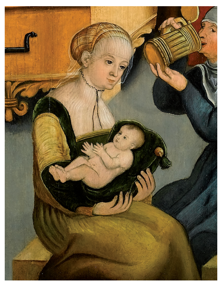
Circle of Lucas Cranach the Elder, The Nativity of the Virgin , c. 1545 (Detail)

The Nativity of the Virgin, provides a fascinating and valuable